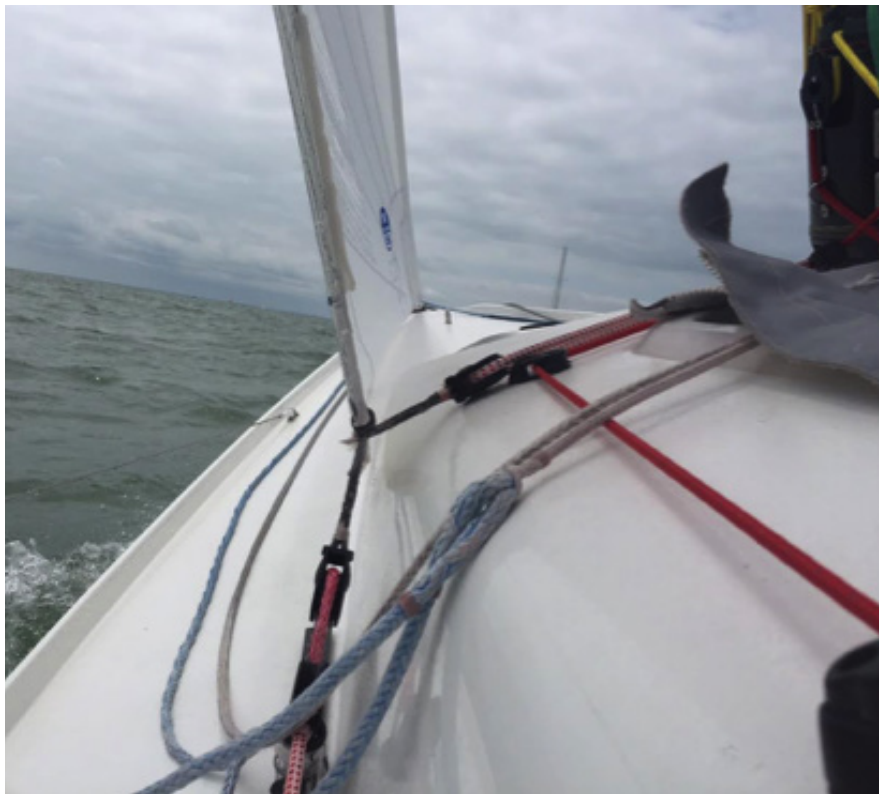
Jib clew shown In-hauled to about 1" from touching cabin house.

For the J-2 jib with no in hauler, the car should be around 3-4 holes showing in front . For the J-2 jib with a lot of in-hauler and the jib clew at 1" from the cabin house, there should be 5-6 holes showing in front.