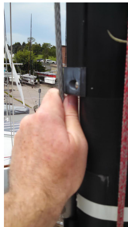
Hold main halyard to bottom of mast track to measure pre-bend

6. Use calipers to check base settings. After setting the base rig tensions and checking the side-to-side center position of the mast, it is a good idea to use calipers to measure the distance between the studs on the shrouds and headstay. This measurement can help you get the rig back to base setting more easily, especially if unsure of the turns or tensions while on the water.