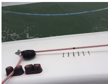
Jib sheet and deck reference marks help accurately repeat trim settings

Make reference marks on jib sheets for both the sheet tension and in-hauler tension. Having reference marks will make it much easier to duplicate your trim settings quickly. Jib sheet and deck reference marks help accurately repeat trim settings. It is a good idea to experiment with different settings for each control to get used to how each control affects the sail and how they interact with each other.